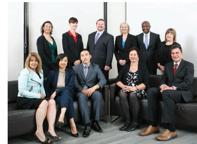
AvSuper Team (L to R):

When you call AvSuper, you'll never get an anonymous call centre. One of our experienced Trustee team will happily help you.